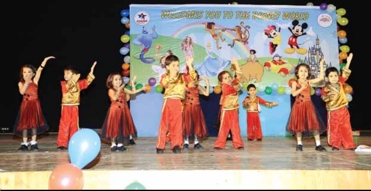
" ડીઝની વર્લ્ડ"ના શિર્ષક હેઠળ ઉજવાચેલા ગ્રેજ્યુએશન ડેમાં સર સચાજરાવ ગૃહ ખાતે કીડઝી સ્કુલના બાળકોએ સુંદર અને રમુજી ડાન્સ રજુ કર્ચા હતા તથા રંગારંગ કાર્ચક્રમના અંતે ગ્રેજ્યુએશન સેરેમની રાખવામાં આવી હતી. ઉપરોક્ત કાર્ચક્રમમાં નાના ભૂલકાઓની સાથે સ્કુલના શિક્ષકો તથા વાલીઓએ પણ ભરપુર આનંદ ઉઠાવ્યો હતો.